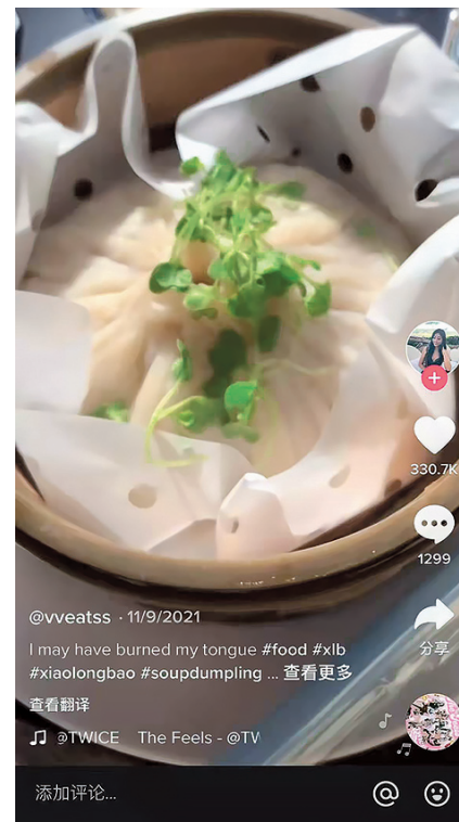
A screen grab of a video of xiaolongbao on TikTok.