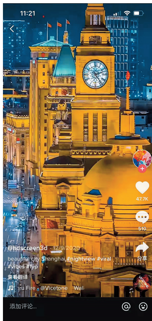
The screenshot of a video of the night scenery of the Bund on TikTok.